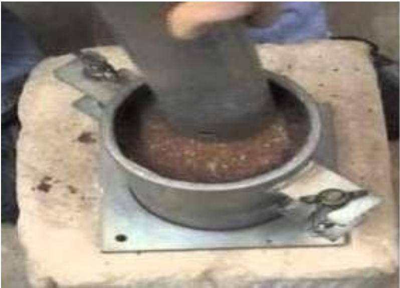
Figure4: Standard Proctor Test;

soil bulk. Laboratory compaction tests are used to determine the amount of water needed to achieve the maximum weight of soil grains per cubic meter of compacted soil. The Optimum Moisture Content is the amount of water. After compaction, various moisture contents and subsequent dry densities may be measured in the lab and displayed on an arithmetic scale, as can be seen above. They're like abscissa and ordinate, respectively. Curves are created by connecting the observed locations.