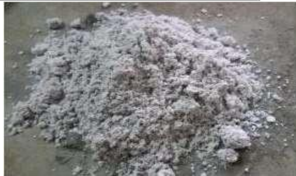
Figure3: Hypo sludge