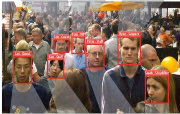
Fig-4. Multiple Faces recognized

After successful training of the model the model is loaded for facial recognition.