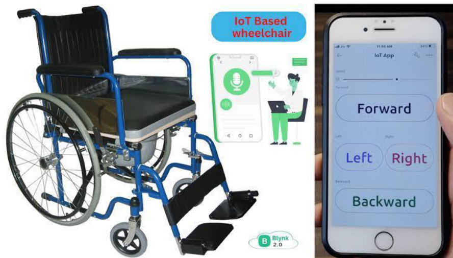
Fig 3.1: Proposed system wheel chair

By incorporating these features into a unified system, the proposed intelligent wheelchair aims to enhance mobility, independence, and overall quality of life for individuals with mobility impairments. Additionally, ongoing research and development efforts can further refine and improve the system's capabilities to better serve its users.